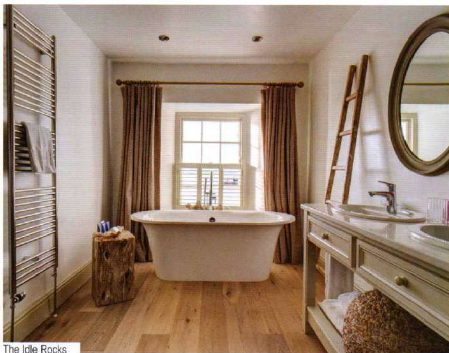
The Idle Rocks

Just two miles outside Newmarket this newly opened and renovated coaching inn brings a much needed alternative to a relaxed and informal British dining experience. With an award-winning chef at the helm the menus are full of fresh, local and seasonal produce transformed into firm favourites with a twist alongside some more unusual temptations. The eight spacious en-suite rooms at The Packhorse Inn are a welcome retreat from