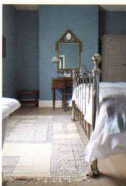
Above: La Locanda delle Donne Monache and left: The Packhorse Inn, Moulton near Newmarket

New for 2014, this 29 bedroom shabby chic country house hotel is perfectly situated near the city of Bath in an undiscovered part of Somerset. Truly rural, surrounded by beautiful British countryside this is the best new hideaway to open this year.